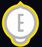
Exhibit at the “Innovators Showcase”

Sponsor a portion of the event (ie: Lunch Break, Closing Concert, VIP After-Party)