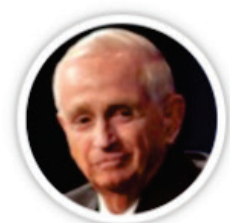
J. Willard Marriott, Jr.